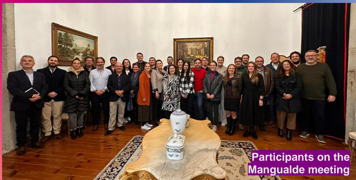
Participants on the Mangualde meeting

A communication strategy session provided guidance on public engagement, while Mantova shared its housing solutions, addressing urban shrinkage and affordability. The day ended with a networking dinner at Quinta dos Monteirinhos.